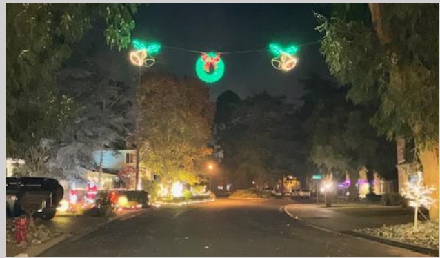
Forest Glade Holiday Magic